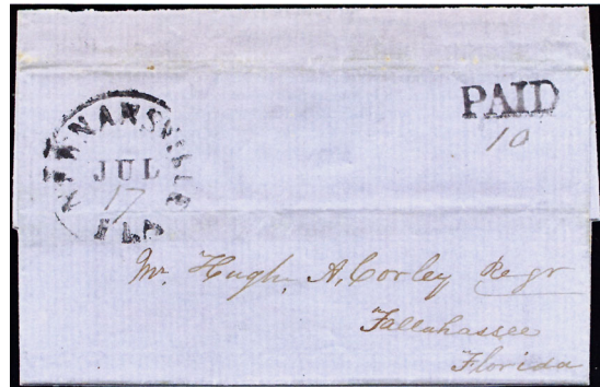
Image Credit: Florida Postal History during the Civil War (2017 book by Briggs).