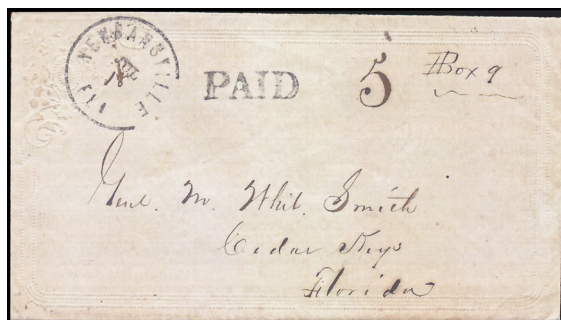
Image Credit: Florida Postal History during the Civil War (2017 book by Briggs).